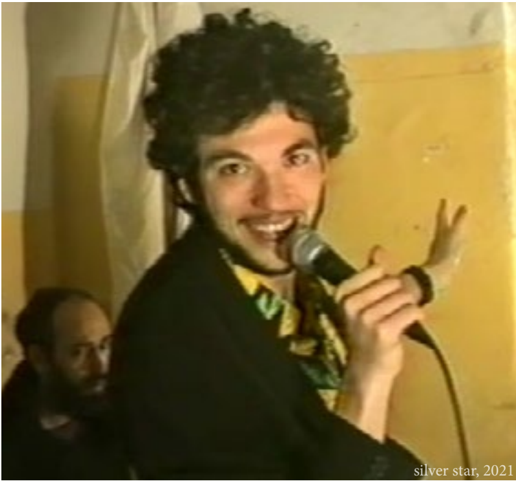
silver star, 2021

for more: finestbakery.art/gal gal@finestbakery.art