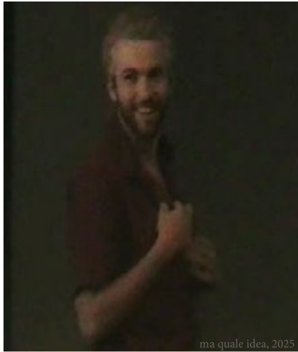
ma quale idea, 2025