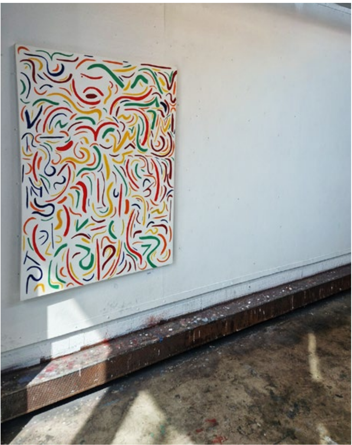
man i, 2025 oil on canvas, 92.5 x 137.2 cm