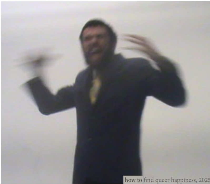
how to find queer happiness, 2025