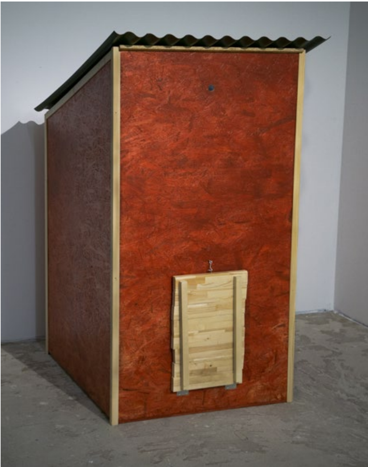
comme des poulets dans le poulailler, 2024 documentation from the 'fabienne levy' gallery, lausanne